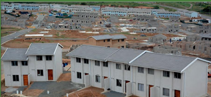
Houses, Security & Comfort for All

14 OCTOBER 2020 SOCIAL HOUSING PRESENTATION